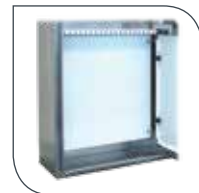
Mounting pan – metal