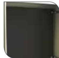
Insulated mounting pan