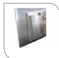
Vent hood – stainless steel