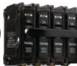
Quicklag MCB 4 pole