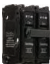
Quicklag MCB 2 pole