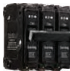
Quicklag MCB 3 pole