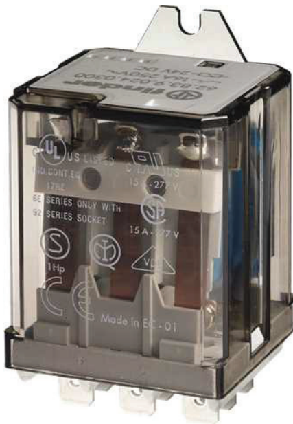
Representative Photo Only (actual product may vary based on configuration selections)