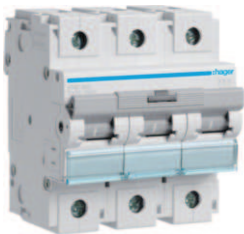
MCB 3P 15kA D-100A 4.5M