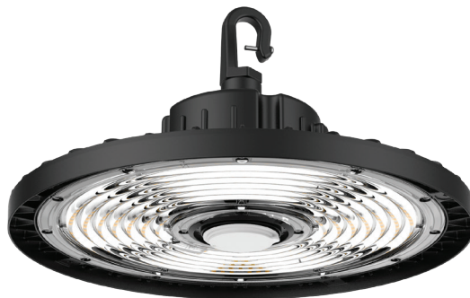
200W D321mm x H121.3mm