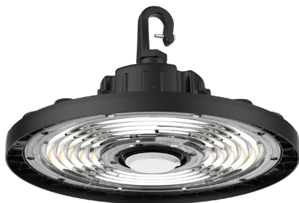
90W & 110W D280mm x H110.2mm