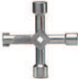
Control cabinet key, metal, for all common types of control cabinet

Please be informed that the data shown in this PDF Document is generated from our Online Catalog. Please find the complete data in the user's documentation. Our General Terms of Use for Downloads are valid ( http://phoenixcontact.com/download )