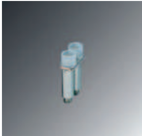
Fixed bridge, Number of positions: 2, Color: silver

Please be informed that the data shown in this PDF Document is generated from our Online Catalog. Please find the complete data in the user's documentation. Our General Terms of Use for Downloads are valid ( http://phoenixcontact.com/download )