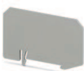
Partition plate, Length: 73.5 mm, Width: 2 mm, Height: 47.2 mm, Color: gray

Please be informed that the data shown in this PDF Document is generated from our Online Catalog. Please find the complete data in the user's documentation. Our General Terms of Use for Downloads are valid ( http://phoenixcontact.com/download )