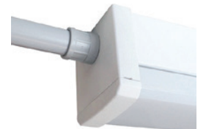
20mm knockouts for conduit or Cable Glands