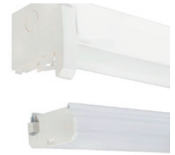
Easy to install with un-pluggable LED module

Commercial, retail and residential applications