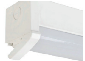
Captive end caps