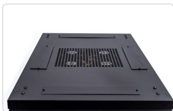
Multiple cable entry glands at the top