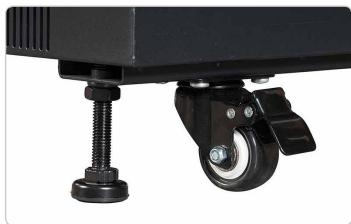
Pre-installed lockable castors and stabilising feet