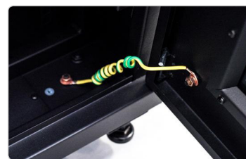
Earth straps on front and rear doors