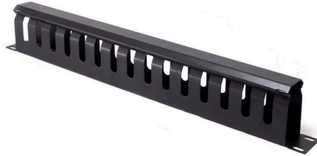
1RU HORIZONTAL 12 SLOTS METAL CABLE MANAGEMENT RAIL