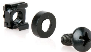
Heavy Duty M6 Cage Nuts, Washer & Screw Set : Pack of 100 : BLACK

PART NUMBER : CB-1P-BK-50 , CB-1P-BK-100