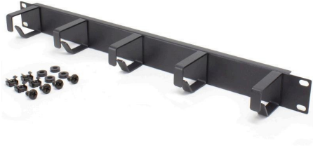
1RU HORIZONTAL 5 RINGS METAL CABLE MANAGEMENT RAIL