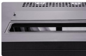
Nylon bush lining in all cable entry glands to protect from wear and tear