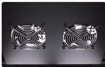
Included roof fan kit