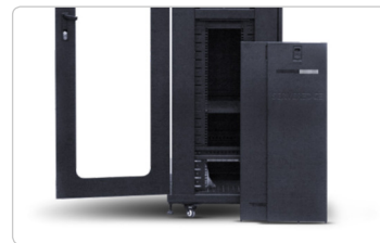
Split side panel