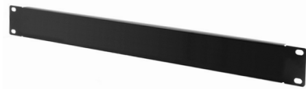
XXRU 19" BLANKING PANEL

PART NUMBER : CT-150-XXRU (XX = RU Number 18, 22, 27, 32, 37, 42, 45)