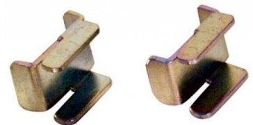
Cabinet Baying Kit

PART NUMBER : CB-1P-BK-50 , CB-1P-BK-100