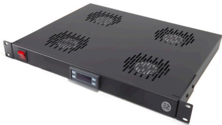
4 Way Fan Kit with Thermostat - 1RU Rack Mountable

PART NUMBER : BP-XXV (XX = Number 01, 02, 03, 04)