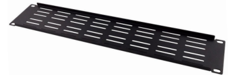
XXRU 19" VENTED BLANKING PANEL

PART NUMBER : BP-XX (XX = Number 01, 02, 03, 04)