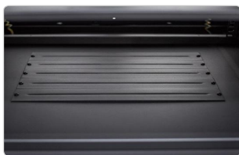
Ample cable entry glands at the bottom