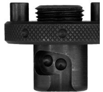
32 - 198mm