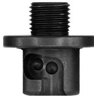
14 - 30mm