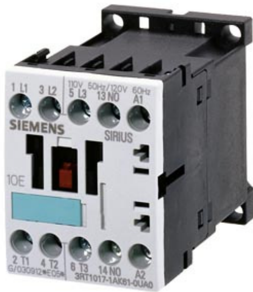
CONTACTOR, AC-3 5.5KW/400V, 1NO DC 24 V, 3-POLE, SIZE S00, SCREW CONNECTION