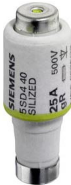
SILIZED FUSE LINK 500V F.SEMICONDUCTOR PROTECTION EXTRA FAST, SIZE DII THREAD E27, 25A