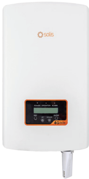
Data Logging Stick