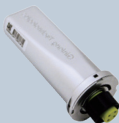
Data Logging Stick GPRS